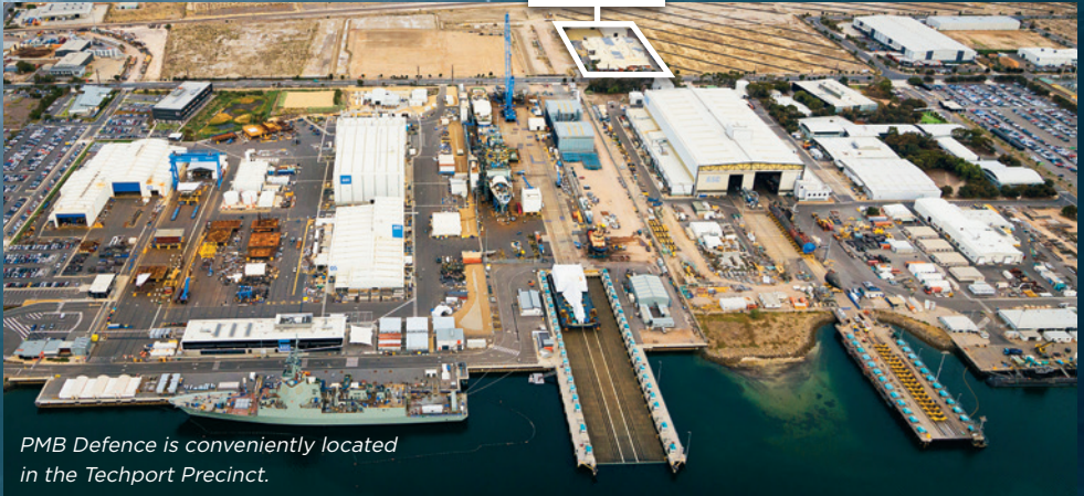
PMB Defence is conveniently located in the Techport Precinct.